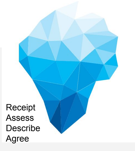
LAGANZ Temporary Storage